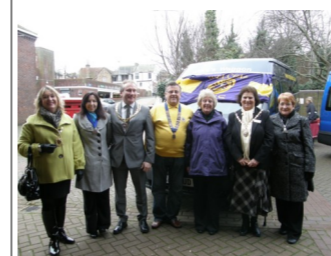
Naming ceremony for the new NPS Lions minibus Newhaven Town Centre