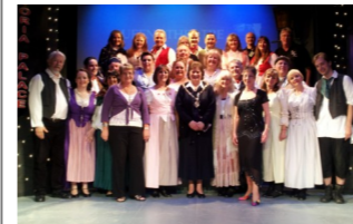
Meeting the cast of the Seaford Musical Theatre