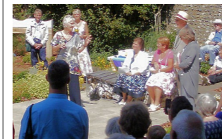
Sheila Hancock opens the Peace Garden