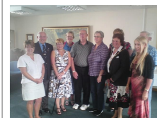
Meeting representatives From Crivitz, USA.