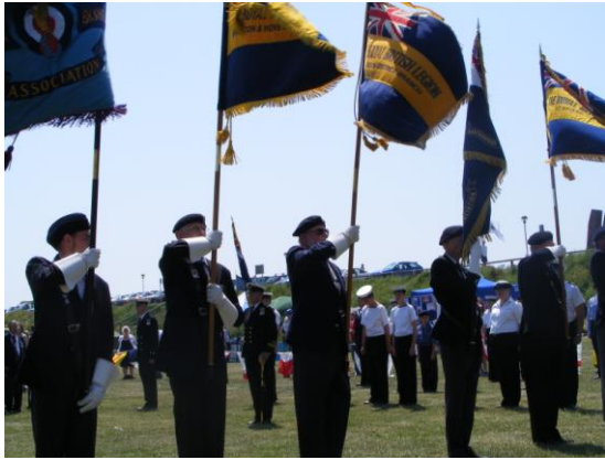
Armed Forces Day