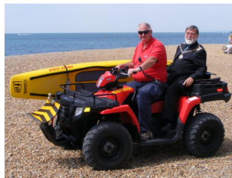
Riding with the Seaford Lifeguards