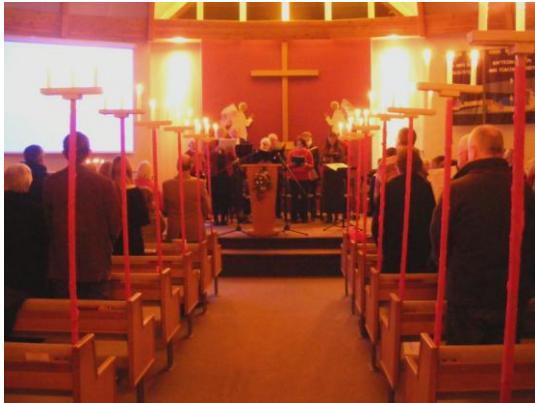
The Mayor of Seaford's Candlelit Carol Service