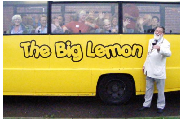
Isn't It Bonkers! 2010