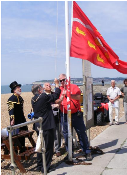
Sussex Day 2010