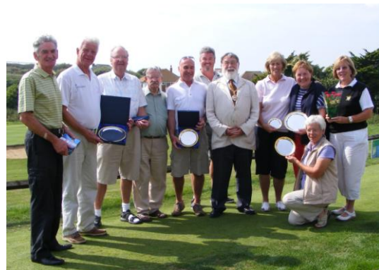
Mayor's Charity Golf Day