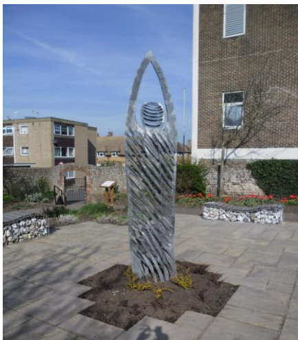
The Peace Garden

An important feature of the committee's work has been its close collaboration with a wide range of community organisations, which brings insight into issues and enthusiasm about resolving them, to the benefit of the town as a whole. The committee has also been greatly assisted by the commitment and enthusiasm of the Projects and Facilities Manager.