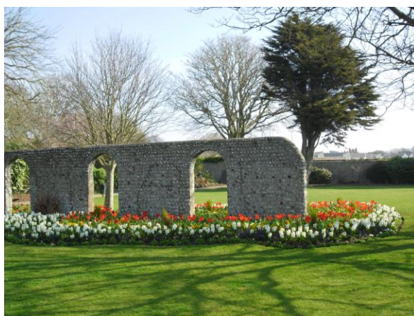
The Crouch Gardens

The Council also debated and decided on many other issues to improve the Seaford Community and welcomed ideas and comments from members of the public during public participation at the start of the meetings.