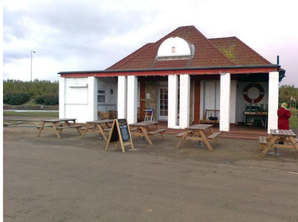
The Salts Café