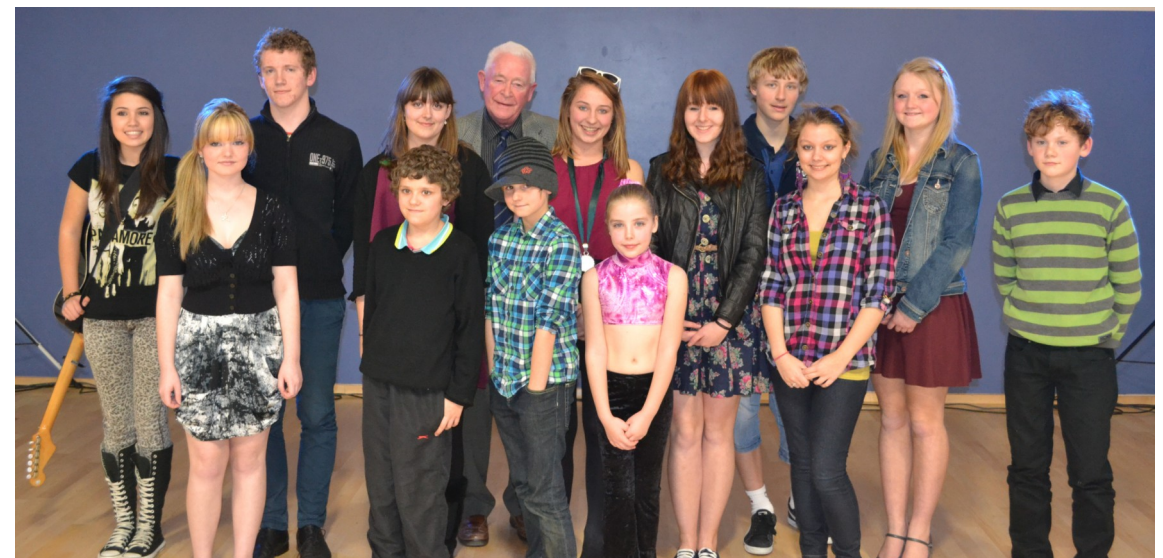
The Judges and Contestants for the Young Performer category of the Seaford Young Mayors Awards