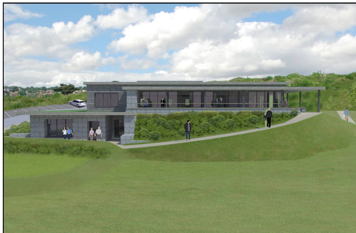
An artists' impression of the new Clubhouse

The new facility could mean the club will be able to attract businesses and societies, thus increasing revenue and ploughing the profits back into the town.