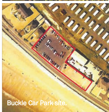
Buckle Car Park site.

Council Officers are moving forward with the actions decided at the meeting, including asking the District Council to halt the proposals until more consultation is completed, writing to the Secretary of State to express concerns over the proposals and the legal process that should be followed, contacting other local Councils that are effected to unite together in opposing the District-wide proposals and registering the car parks within the town in the Community Right to Bid scheme run by Lewes District Council.