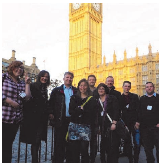
Members of staff on a guided tour of the Houses of Parliament.

Visit the Council's website for further information on the staff structure and individual job descriptions.