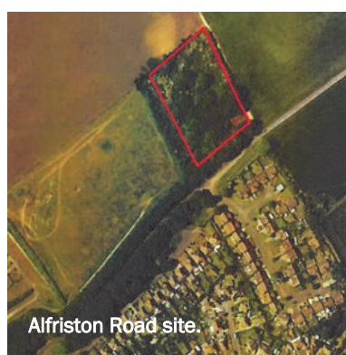
Alfriston Road site.

It was a well-attended meeting, with over 130 members of public coming along to voice concerns and make comments on the proposals.