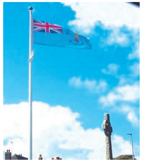
The Royal Air Force Association's flag at the war memorial on Sutton Road.

The Royal Air Force Association flag is flown at the War Memorial on Sutton Road for two weeks from 15 September in remembrance of this battle and those who served and continue to serve for our country.