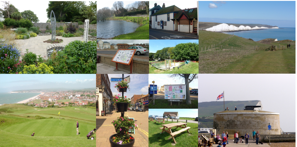
Left to right, top; Peace Garden in Crouch Gardens, Blatchington Pond, Old Town Hall and South Street Toilets, Heritage Trail sign, Crouch Gardens play area, and Seaford Head Nature Reserve. Bottom; Seaford Head Golf Course, Seaford in Bloom scheme, public noticeboards, memorial seating at South Hill Barn, and Martello Tower.

Seaford Town Council owns and/or is responsible for many services and facilities across the town including the Seafront promenade and facilities, The Salts, The Crouch, many open spaces, South Hill Barn, Seaford Head Nature Reserve, Seaford Head Golf Course, public noticeboards, public seating, memorials, the seafront and concessions, beach huts, Seaford in Bloom, Christmas Lights and The View at Seaford Head. In addition, through valued partners, the Town Council delivers Seaford allotments, Seaford Museum, The Crypt art gallery, the Heritage Trail and Exercise Path, CCTV for the town and major events such as those detailed over the page.