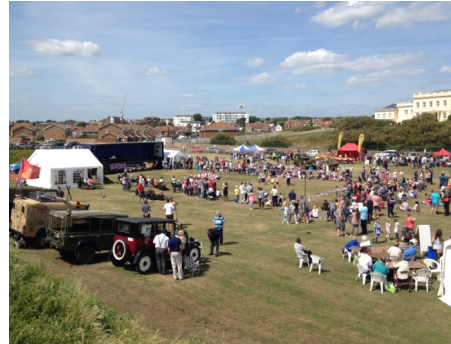
View of the busy Martello Field