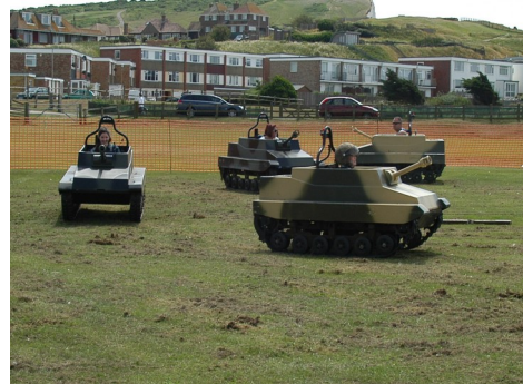
Mini tank rides for children to have a go on