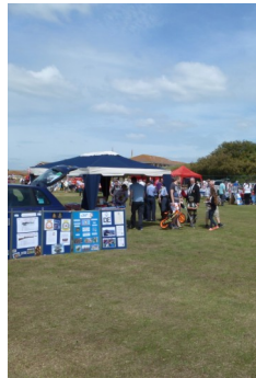
Various community groups and families attended the event