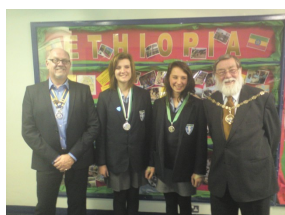
Deputy Young Mayor Award