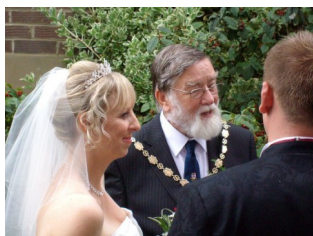
A Mayoral Wedding Guest