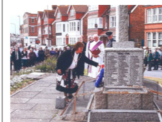
Laying a wreath at the war memorial on the A259