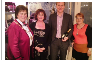
Millies, winner of the late night shop front competition.