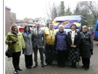
Naming ceremony for the new NPS Lions minibus Newhaven Town Centre