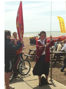
Raising of the Sussex Flag Sussex Day 19th June 2011