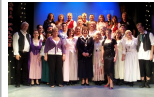
Meeting the cast of the Seaford Musical Theatre