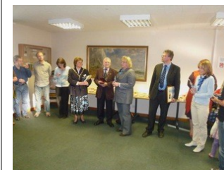
Meeting the representatives from BÖNNINGSTEDT, Germany