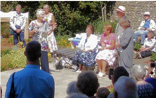
Sheila Hancock opens the Peace Garden