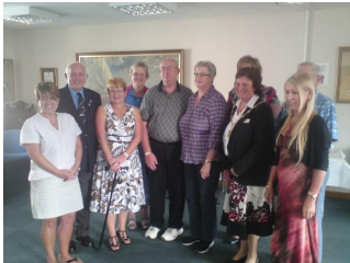
Meeting representatives From Crivitz, USA.