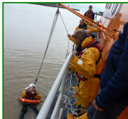
Newhaven Lifeboat Crew in action