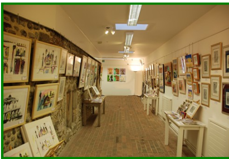
Exhibiting space within the Gallery

The website can be found at: www.thecryptgallery.com , they also have Facebook and Twitter Accounts to be followed.