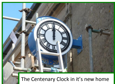
The Centenary Clock in its new home

Well-respected clock repairers Smiths of Derby carried out the maintenance works and relocation, and thankfully were able to return it to full working condition where it will now provide time for visitors to the town centre as well as being an attractive feature and part of the history of the high street.