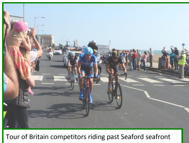
Tour of Britain competitors riding past Seaford seafront

As the cyclists came through the area they were greeted and cheered on by thousands of excited supporters, hoping to catch a glimpse of all of the athletes including the legendary Sir Bradley Wiggins.