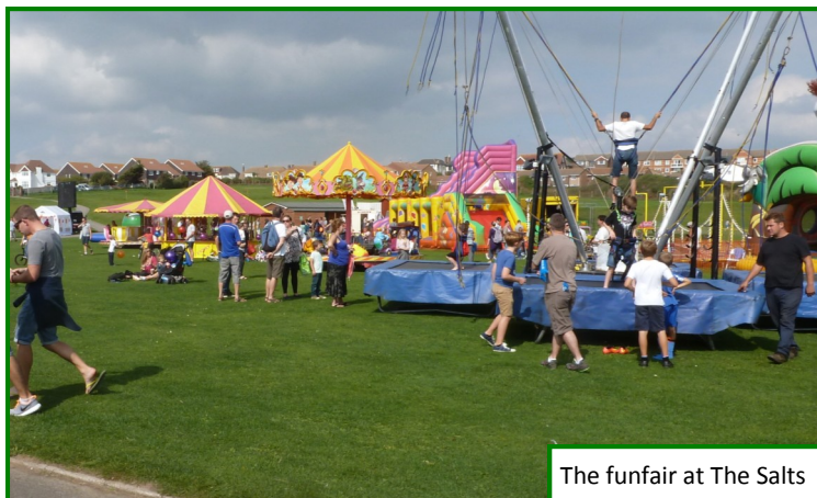
The funfair at The Salts

The day was an enormous success! We created new partnerships, raised awareness and generated more positive interest in Seaford as a whole.