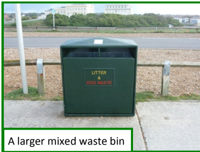
A larger mixed waste bin

Just as vital was the installation of the new, larger mixed waste bins on the seafront. It is hoped that this will reduce the amount of litter being found on the seafront and encourage and enable people to be more considerate of our scenic coastline.