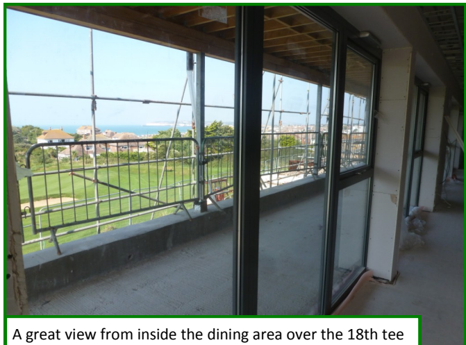
A great view from inside the dining area over the 18th tee