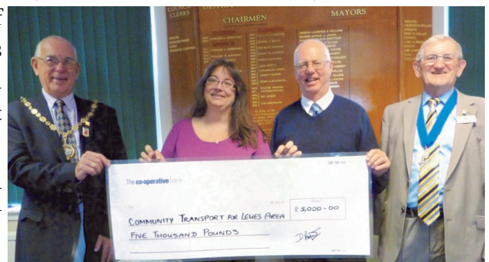
Community Transport for the Lewes Area (CTLA) receiving its grant cheque in the 2015/16 scheme.

More details on the grants scheme can be obtained from the Town Council offices at 01323 894 870 or by email to admin@seafordtowncouncil.gov.uk