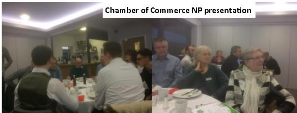
Chamber of Commerce NP presentation