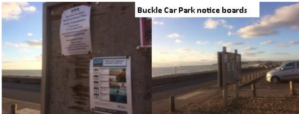
Buckle Car Park notice boards